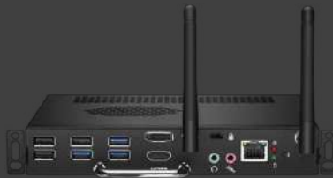
GRAYT OPS Computer