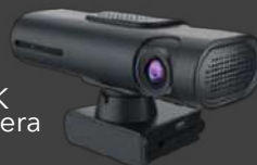
GRAYT 4K Web Camera