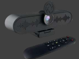
GRAYT 4K Classroom Camera