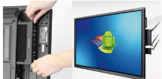
A wide choice of OPS