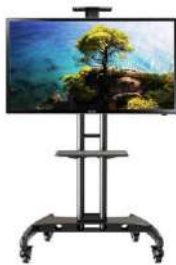
Floor Mount Kit for Panel