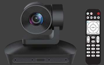
GRAYT 4K PTZ Camera