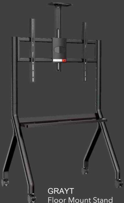
GRAYT Floor Mount Stand