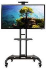
Floor Mount Kit for Panel