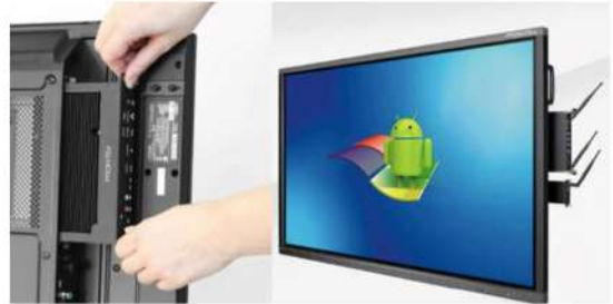
A wide choice of OPS

Disclaimer: Due to product refinement and manufacturing process, actual body assembly weight may vary please refer to the actual product. The product images in this specification are for illustrative purposes only may be adjusted and revised in order to match the actual product performance and specifications. In the event that such changes and adjustments are necessary, no special notice will be given. The actual product effort (including but not limited to appearance, color and size) may vary slightly. Please refer to the actual product in order to provide accurate specifications as far as possible. The text expressions and pictures in this specification may be adjusted and revised in real-time. The product specifications