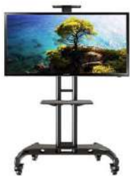
Floor Mount Kit for Panel