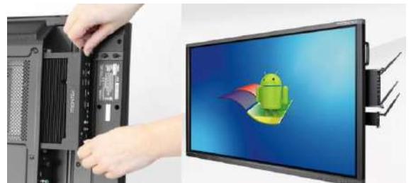
A wide choice of OPS